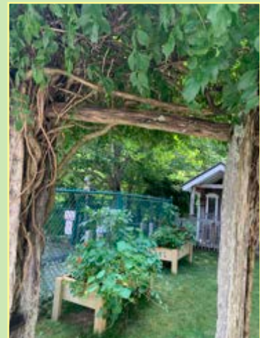
Summer Gardens at HCCDC which included a grant from Laurel Mountain Garden Club to plant the vegetables.