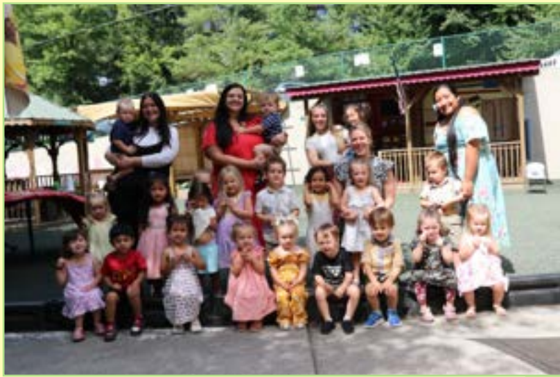
Our Annual Tea Party Fun and Food in July