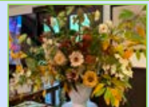
Snip, Sip, & Support celebrating HCCDC in Sept. with Cristy Curcucu's Floral Workshop